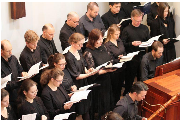
St John's Bach Choir