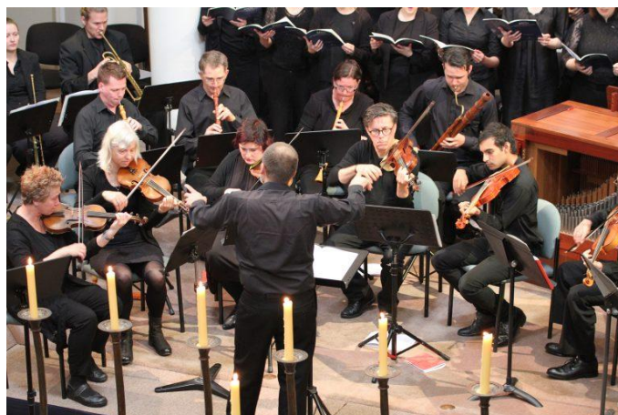
St John's Bach Orchestra

No admission charge (donations/offering are gratefully received). Parking available at service times. Enquiries: telephone 9682 4995.