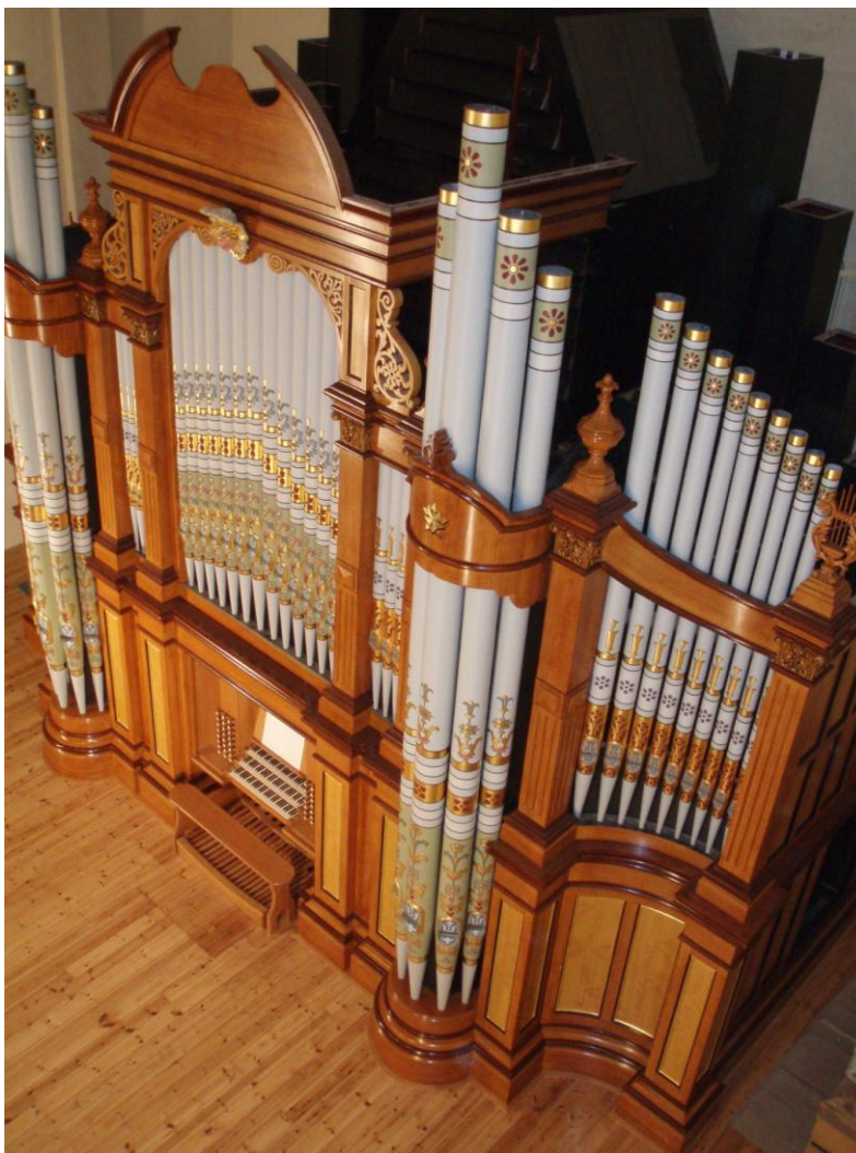
Restored 1877 Hill & Son organ at the Barossa Regional Gallery, Tanunda, SA